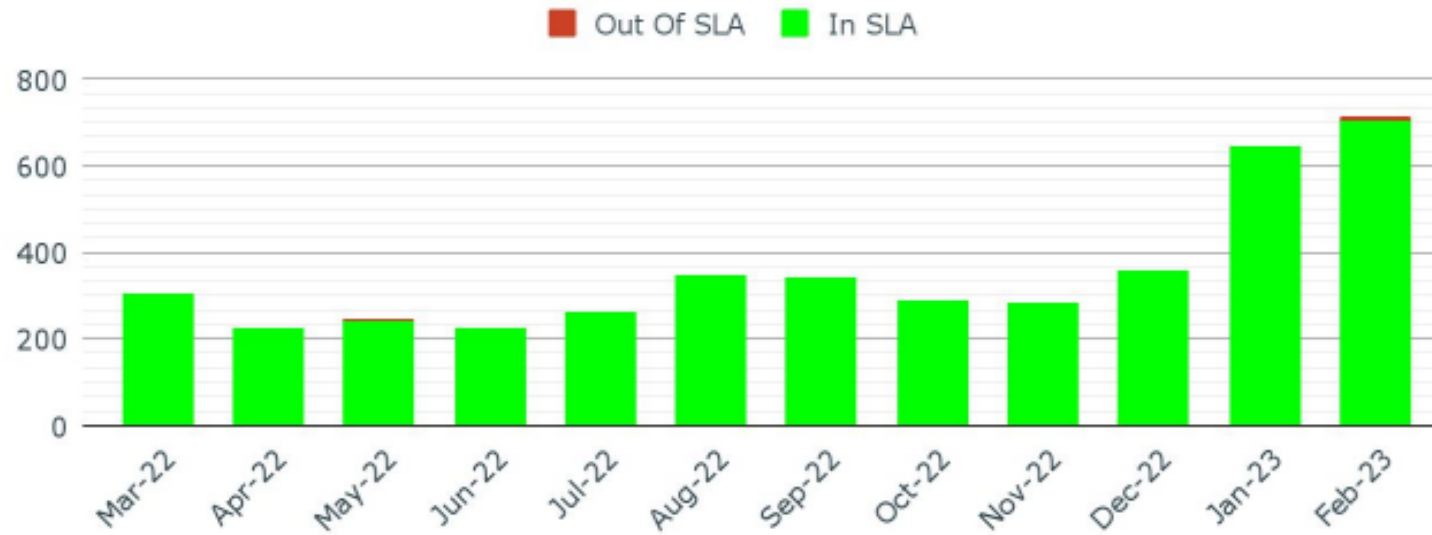
SPI 16: Rectification of Non Town Centre Street Below Grades within 24 hours